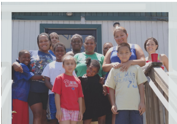
ERLH parents and children outside Education Center trailer after annual end-of-school-year volunteer clean-up event.

Some 20 ERLH children and their parents took time out of their busy schedules to participate in a special seven-week program to reduce conflict and improve family communication. Prevention Plus of Burlington County funded and provided instruction for the Strengthening Families Program. Each session started with a family dinner, then the parents and children engaged in different activities. ERLH moms and dads were asked to watch videos of parents interacting with their children, then reflect upon and discuss the scenarios presented on-screen. In a separate room, the children discussed peer pressure, substance abuse and conflict resolution. At the end of each session, the parents and children completed a team project and were assigned homework to be completed by the next session. Many ERLH families said they found the activities to be helpful and insightful.