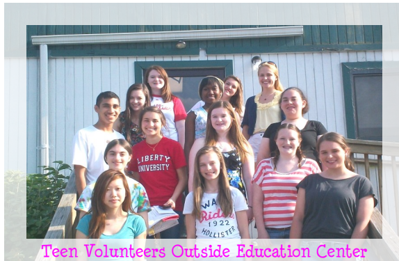
Teen Volunteers Outside Education Center

Teen and high school volunteer partnerships are an essential component of our after-school and summer enrichment program. Collaborating organizations include Quixote Quest, the Lenape National Honor Society and ERLH teens. The teens mentor and