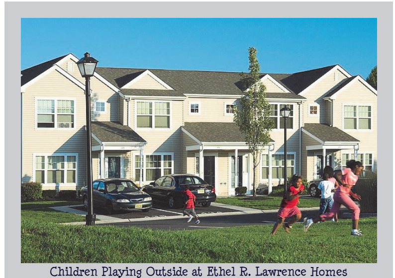
Children Playing Outside at Ethel R. Lawrence Homes

The Margaret Donnelly O'Connor Education Center at Ethel R. Lawrence Homes is operated by Fair Share Housing Development (FSHD), a non-profit housing and social services provider that seeks to reduce racial and economic segregation throughout Southern New Jersey. Through the development of affordable homes in high-opportunity communities, pursuant to the Mount Laurel Doctrine (which requires that every town in New Jersey provide its "fair share" of affordable housing), FSHD has built and manages 656 affordable units in Burlington, Camden and Gloucester counties. Ethel R. Lawrence Homes, our award-winning flagship development in Mount Laurel Township, provides 140 townhome-style apartments in a safe environment with access to one of NJ's top school districts.