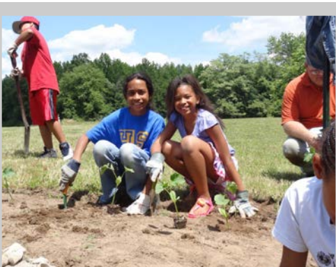
ERLH kids planting vegetables in the Education Center’s new community garden